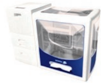
Espresso Book Machine

EVER WANTED TO PUT YOUR MEMORIES, EXPERIENCES, THOUGHTS, CREATIVITY, OR DREAMS INTO A BOOK? IF YOU'VE PICKED UP THIS PAMPHLET, YOU PROBABLY HAVE. MAYBE YOU'VE ALREADY PUBLISHED, OR JUST DREAMT OF IT. WITH THE ARRIVAL OF THE ESPRESSO BOOK MACHINE (EBM), AND THE ESPRESSNET*, AUTHORS HAVE BECOME EMPOWERED AS NEVER BEFORE. PUBLISHING